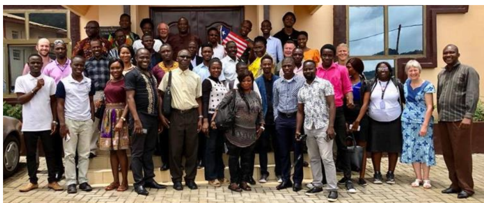
Media Training in Sierra Leone