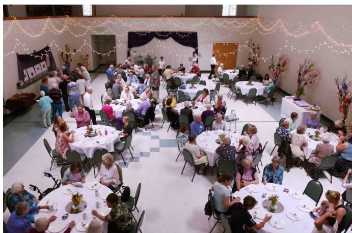
140 people crowded into Faith Hall to say goodbye