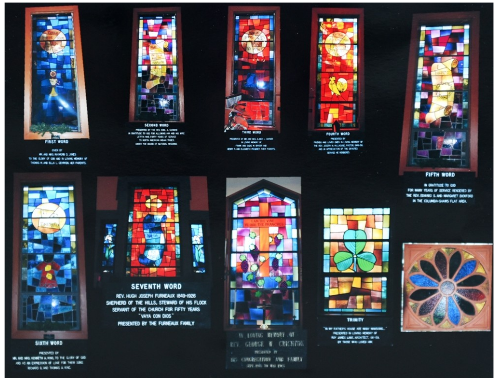
This collage depicting all of the stained glass windows was most likely created by Laurie Sylwester.