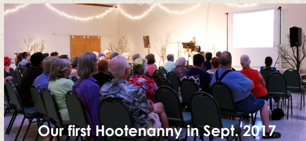
Our first Hootenanny in Sept. 2017