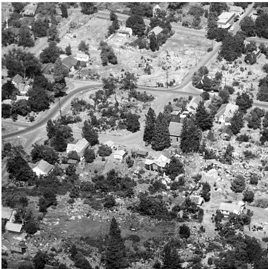
Bird's eye view of a section of Columbia about 1949. The old Church of the 49ers' sanctuary is seen just to the right of center with a clump of trees surrounding it.