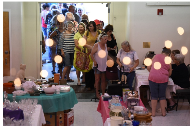
Preview Night August 23rd after doors opened