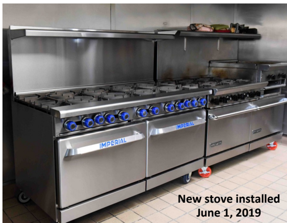
New stove installed June 1, 2019