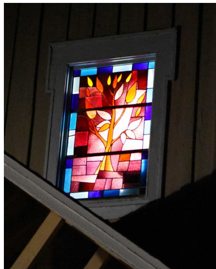
The Pentecost Window, dedicated in memory of Vada Carpenter

Part Two of the saga of our stained glass windows will come to you in the July 2019 Golden Nugget. Stay tuned!