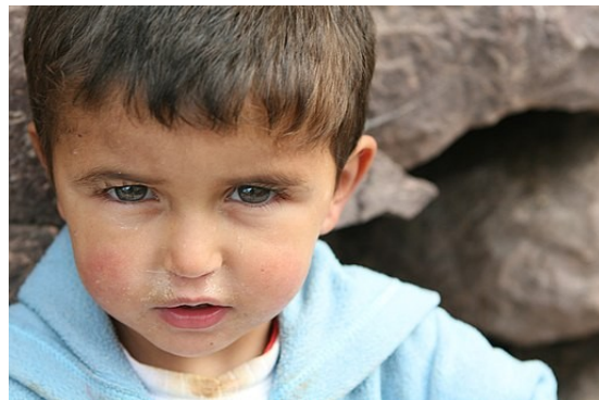
Boy in Berber Village

Please be praying for the release of many brothers and sisters in our region