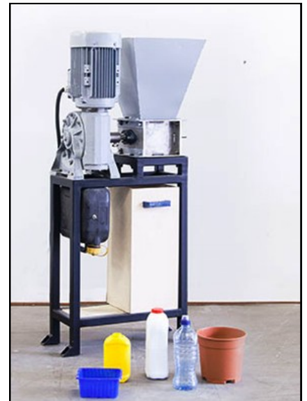
Shredder machine for Trash 2 Treasure project