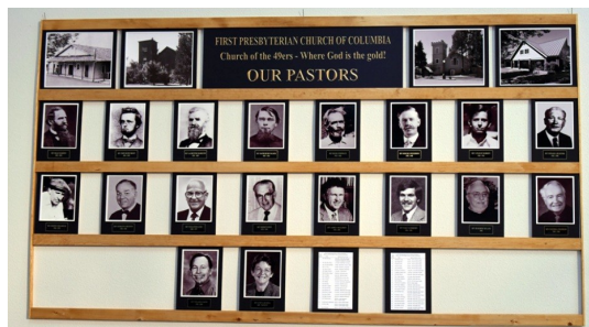
Pastors Wall completed August 2017

The History Committee's Vision Statement includes several long-range objectives, although, once again, a few still have mixed feelings. Unfortunately, the committee is still in search of a few gifted volunteers to pursue its objectives and replace the aging and retiring traditionalists. Where are the millennial