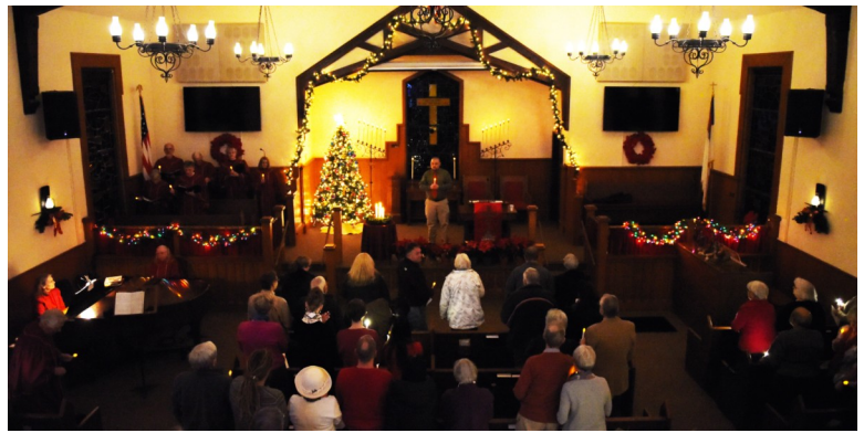
Christmas Eve 2019

Visit churchofthe49ers.com to listen to any past sermons. Click on "Worship" and "Sermons" and then the small white triangle on the left underneath each sermon listed. The audio includes the Scripture verses being read and goes right into the sermon.