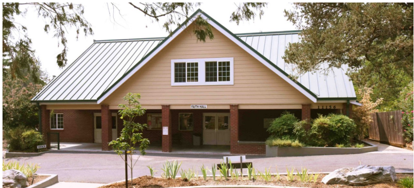
Location of the Church Archives: The History outer room is identified by the windows on the upper floor, and the actual Archives Room is to the right.