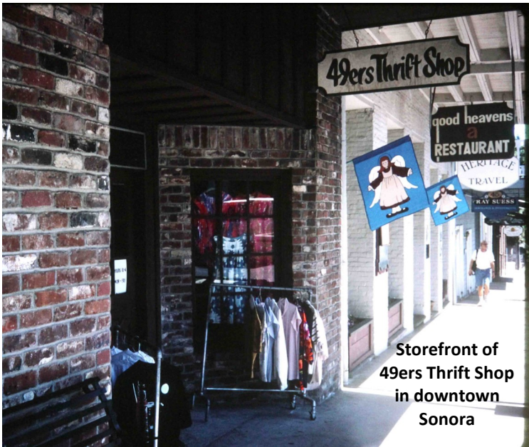
Storefront of 49ers Thrift Shop in downtown Sonora