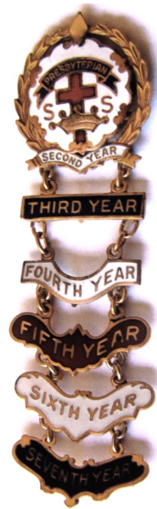
The young people earned this pin for their participation in Sunday School.