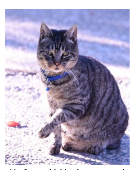
Mr. Grace with his winter coat, and extra layer of fat. He continues to guard the church and misses you all.