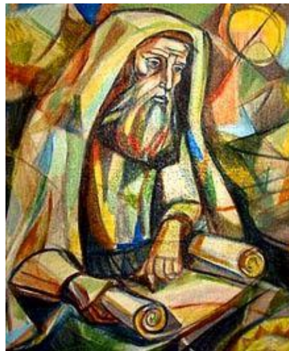
Jeremiah the prophet

And this passage from Jeremiah is extremely important because it is one of