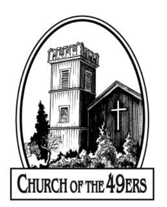
First Presbyterian Church 11155 Jackson Street Columbia, CA 95310

April 28, 2:00 pm: Women's Bible Study in CE Room 3