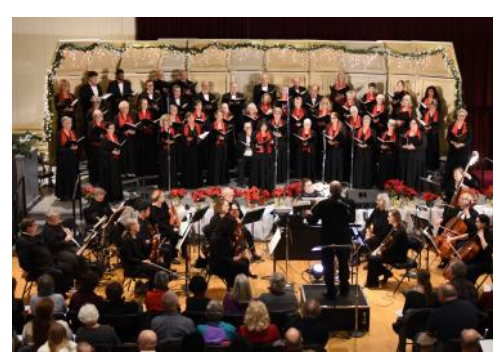
Community Chorus in December 2019

You will have three opportunities to enjoy the Spring Concert—all are FREE performances. The largest will be held outdoors in the Carkeet Amphitheatre on the Columbia College campus on Sunday, April 24, at 3:00 pm—no tickets