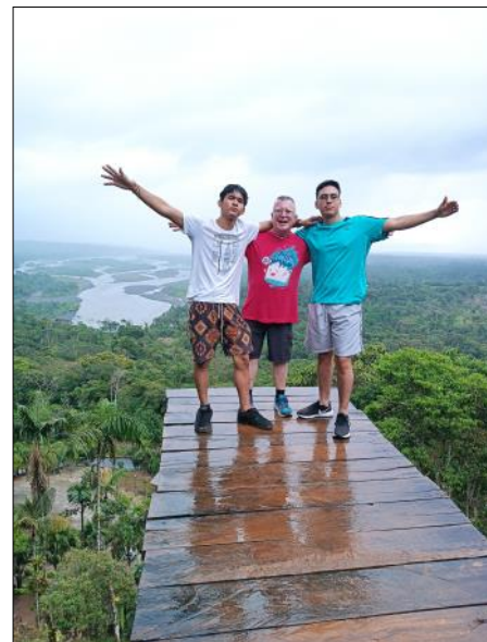
Mid-July I was able to take my two oldest grandsons to Ecuador's Amazon region. This was their first time to the jungle. We had so much fun!

On the same note, please continue to pray that the specifics of the agreement, which was made to bring an end to the strike, will be fulfilled. Both sides have been meeting these past weeks to hammer out the details so that future protests can be avoided.