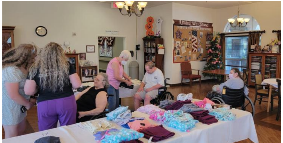
Avalon residents enjoying their donations.