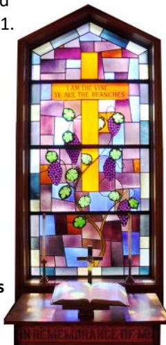
Crichton Cross Window