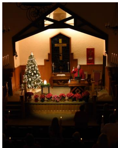
Singing Silent Night on Christmas Eve