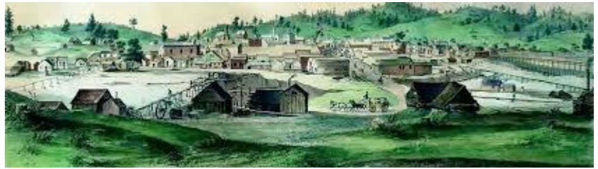
Columbia in the early days

SIERRA NEVADA. During the early 1770s, Spanish explorers and Franciscan padres described the distant mountain range as being "white from the summit to the skirts"; others