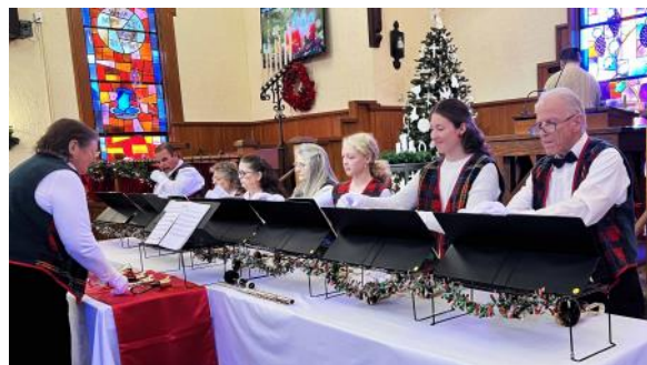
Handbells on December 18