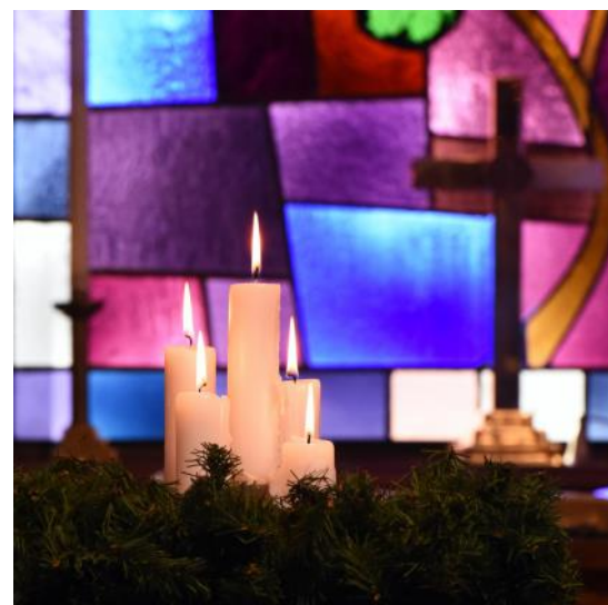
Advent Candles Christmas Morning