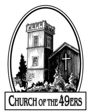
First Presbyterian Church 11155 Jackson Street Columbia, CA 95310

Mar 30, 9:30 am: Line Dancing in Faith Hall