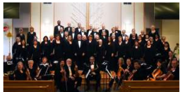
Columbia College Community Chorus - April 2019

Also, if you'd like to carpool to the concert, contact Leslie at 209-559-7723.