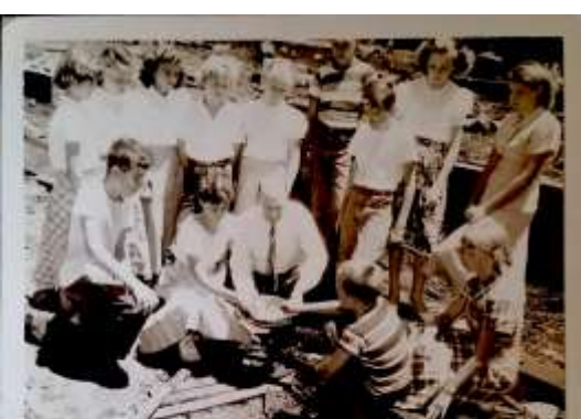
After the 1950 fire, youngsters presented their savings to the church.

Within four years of the fire, the new church—a replica of the original—was ready for dedication. A special ceremony took place in December of 1954, just 100 years from the date of organization.