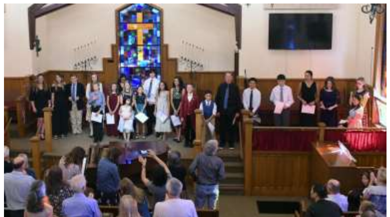
Picture of the participants in the 2023 Bach Festival Youth Concert.

Visit sonorabach.org for more information on these, and the re- maining concerts this fall — the Salon Concert and Bach’s Brunch scheduled for October 22 and 29 respectively.