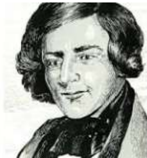
Jedediah Strong Smith

In his informative journal and family letters, Smith reminisced, "...God only knows, I feel the need of the watch and care of a Christian Church...men of good morals seldom enter into this business...I hope you will remember me before [His] Throne of Grace...that I might be able to help those who stand in need. Pray for me, My Brother..., as I face every danger...."