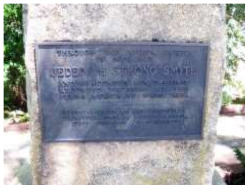
Jedediah Strong Smith marker erected 1930, located in front of the Tuolumne Historical Society Museum on West Bradford Street, Sonora.