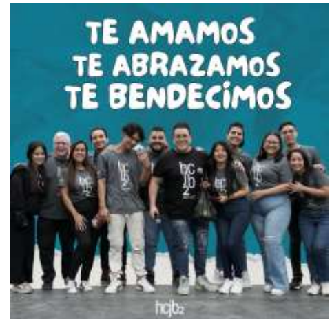
We love you, we hug you, and we bless you. Team Esperanza (HCJB2 Team)