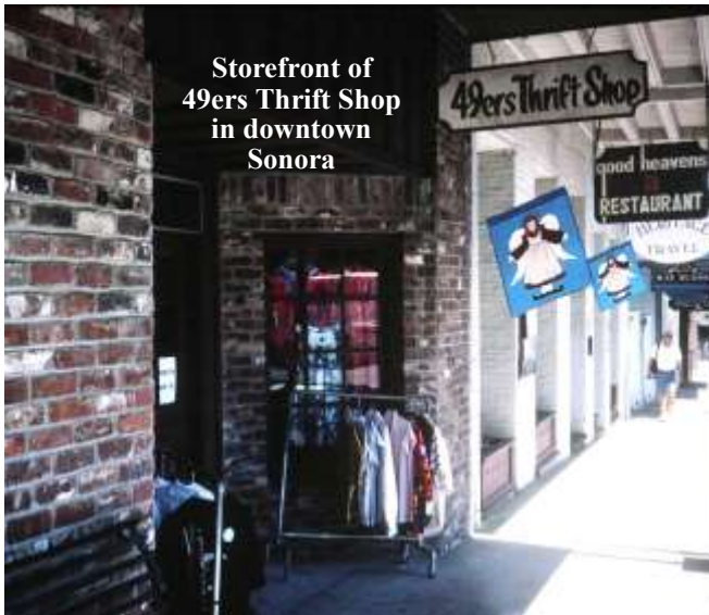
Storefront of 49ers Thrift Shop in downtown Sonora