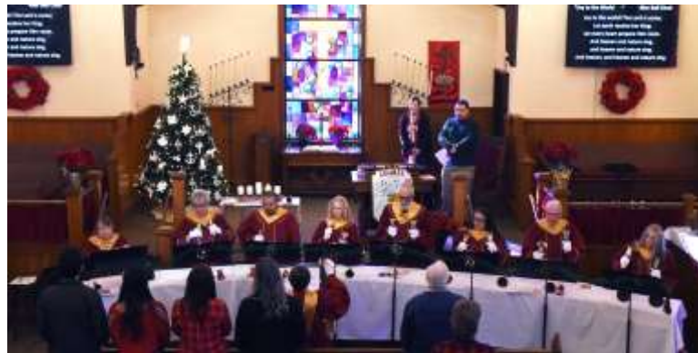
10 am Service