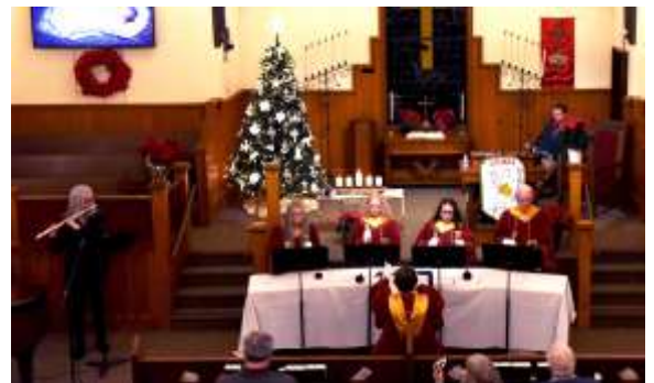
7 pm Service