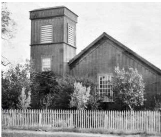
This photograph of the sanctuary and bell tower was taken some time before 1950. Note the crenellations are missing from the top of the tower.

Continued on Page 9 See "Historic Old Columbia"