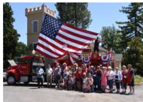
At the end of the hot dog BBQ last year