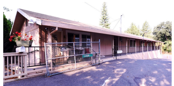
Christian Education Building in July 2018