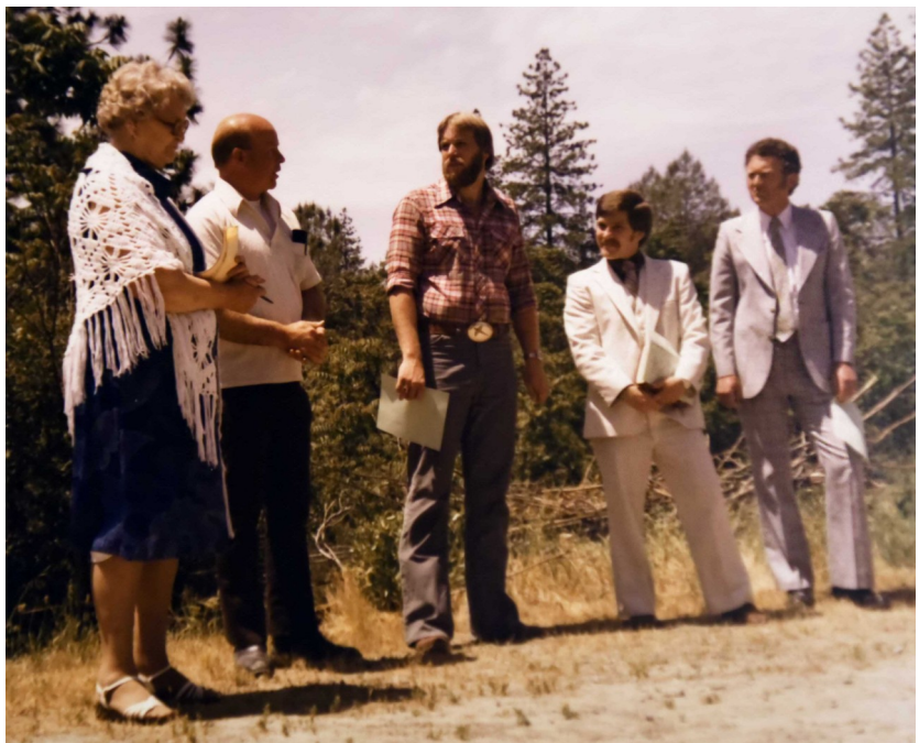
Ground Breaking Ceremony for Christian Education Building May 17, 1981