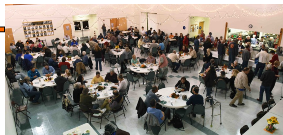
Thanksgiving Feast 2018