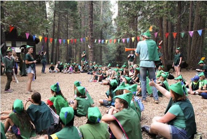
Image of Sherwood Forest Camp at Calvin Crest - July 2017